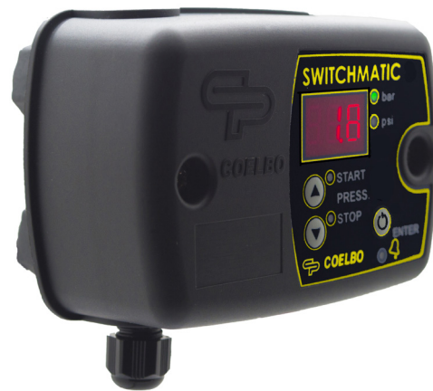
SWITCHMATIC 3 SWITCHMATIC 3/in-out